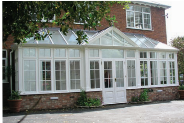
Dev Aura the home of the Academy